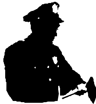
Traffic enforcement, responding to emergency activities...